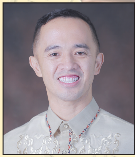
HON. DE CARLO L. UY. MBA (Vice Governor) Acting Governor